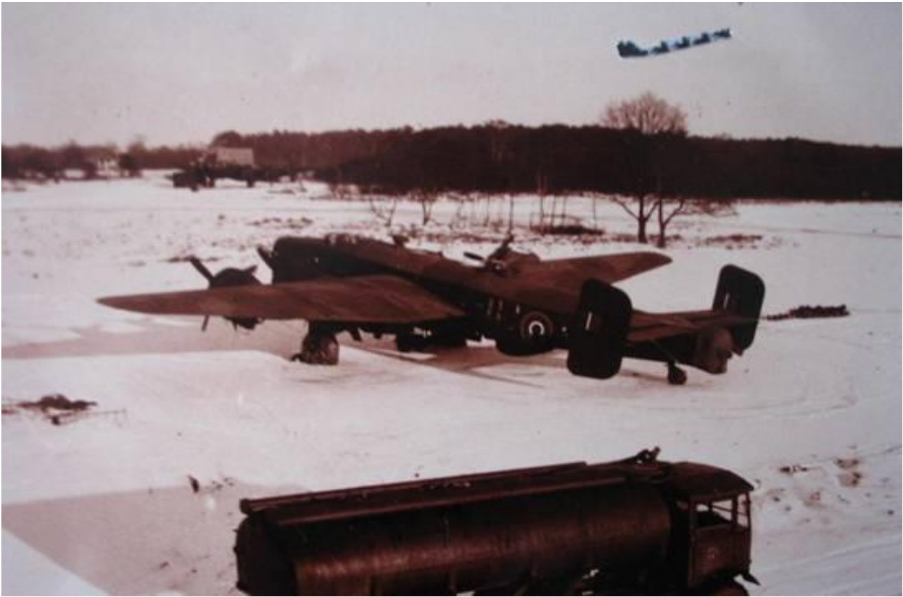
UFO over RCAF 432 Squadron- Eastmoor, Yorkshire December 24, 1944